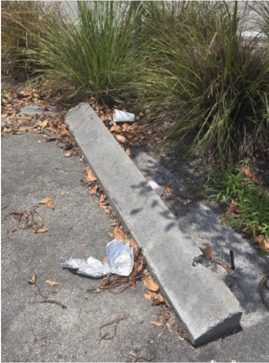
Large amounts of litter.