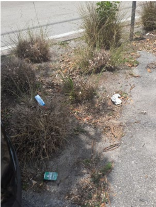
Landscaping in poor health.