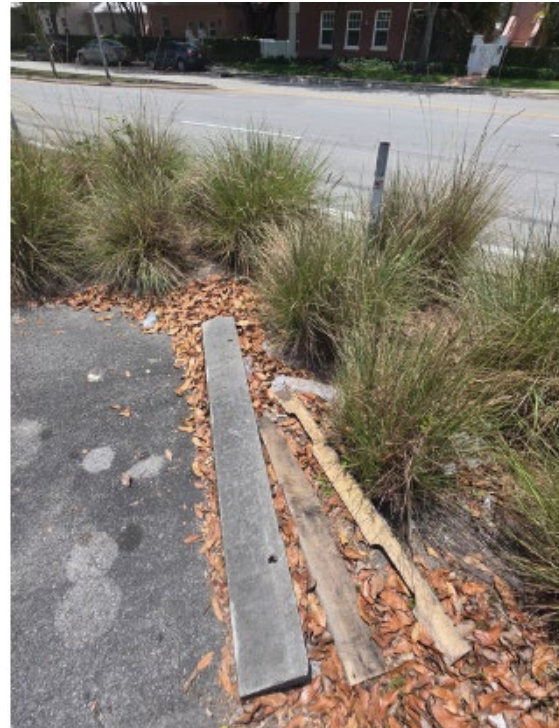
Broken and out of place parking bumpers.