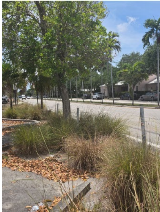
Area looks unmaintained.