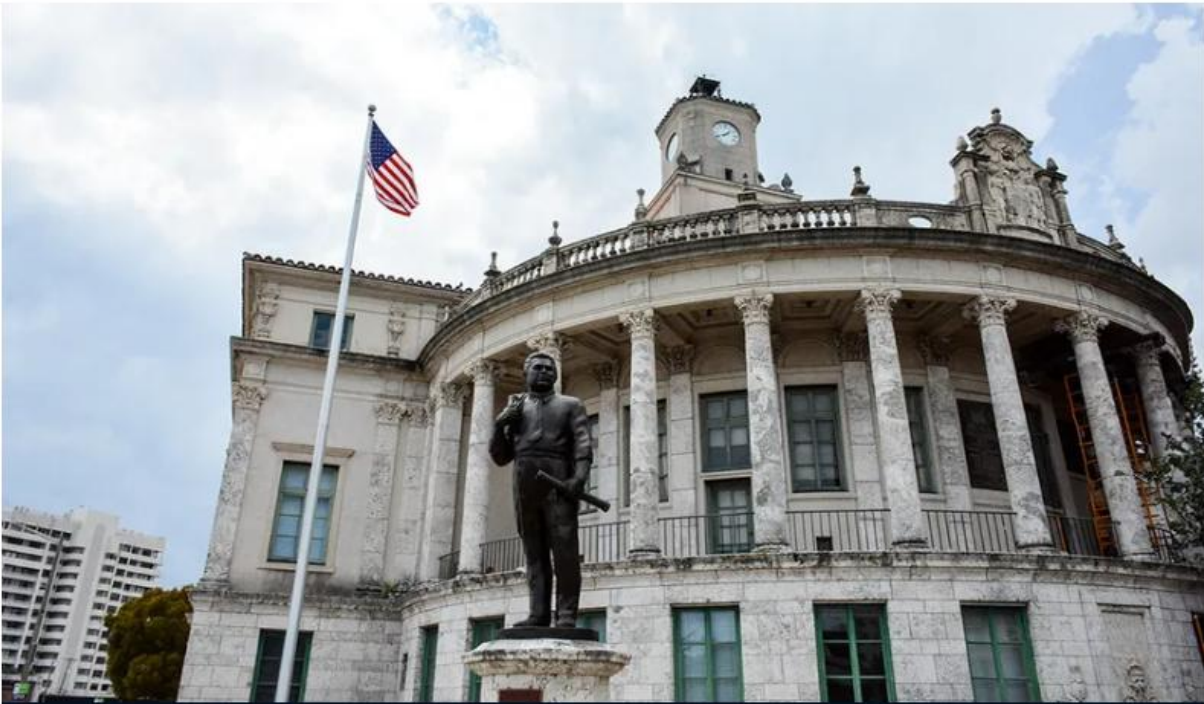
The City Council of Coral Gables.

The residents of the 'Ciudad Bonita' will determine through a postal referendum eight reforms that would alter the electoral calendar, the municipal ethical oversight and the voting system