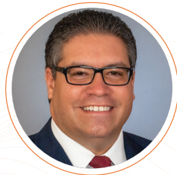
Ariel Fernandez Commissioner