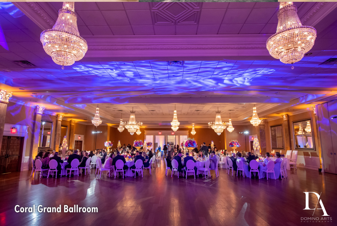
Coral Grand Ballroom