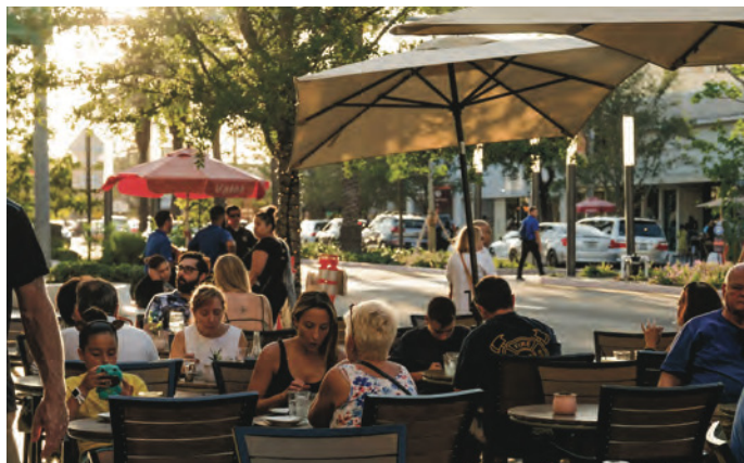
Outdoor dining on Miracle Mile