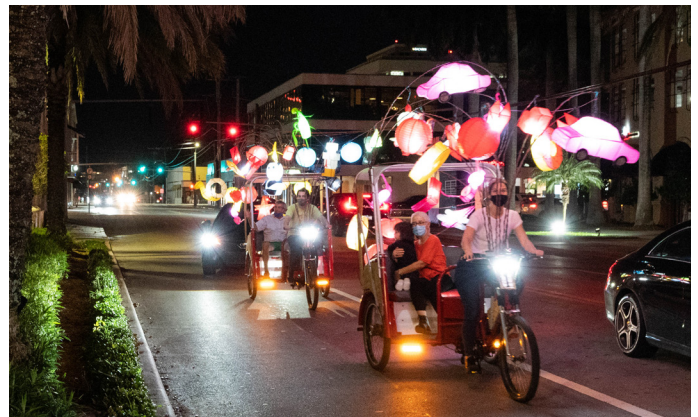
Fireflies, pedicabs from Illuminate