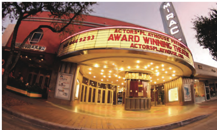
Actors' Playhouse at Miracle Theatre