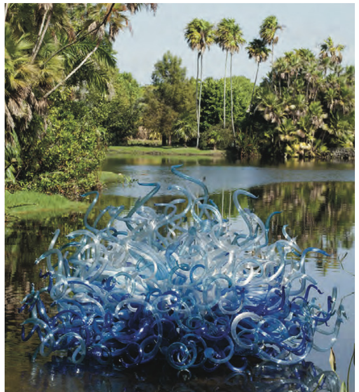
Chihuly art at Fairchild Gardens