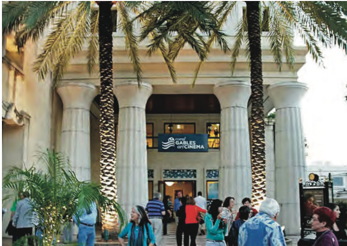
Coral Gables Art Cinema

Coral Gables has become one of the most vibrant centers for the arts in South Florida, with countless cultural offerings located both in the heart of the City or just minutes away.