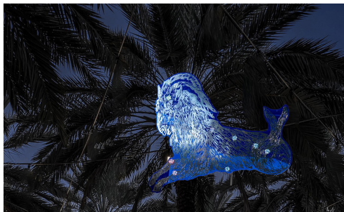
Kiki Smith, Blue Night at Giralda Plaza