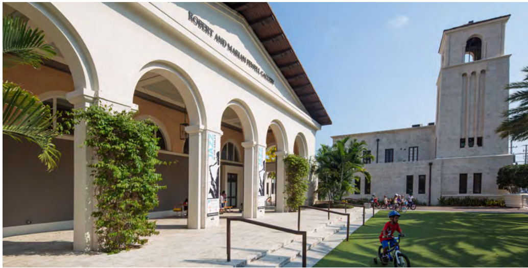
Coral Gables Museum