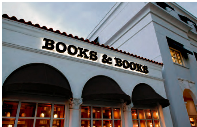
Books & Books