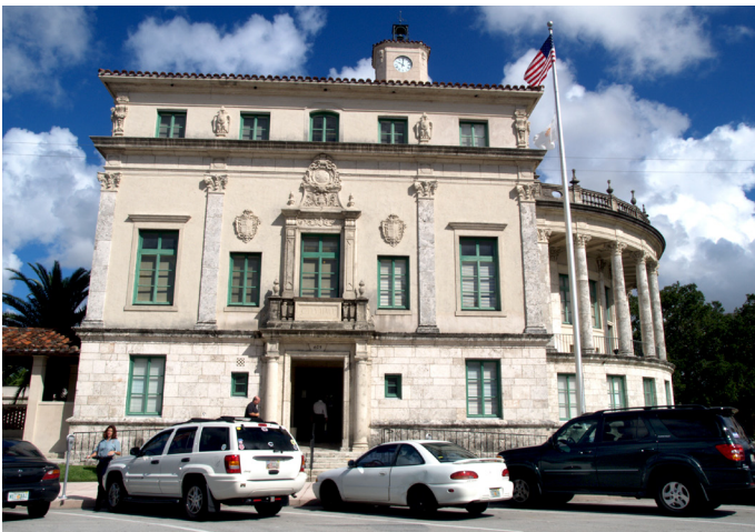
Coral Gables City Hall