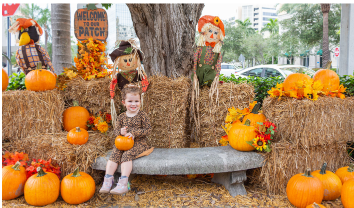
Pumpkin Patch at Pittman Park