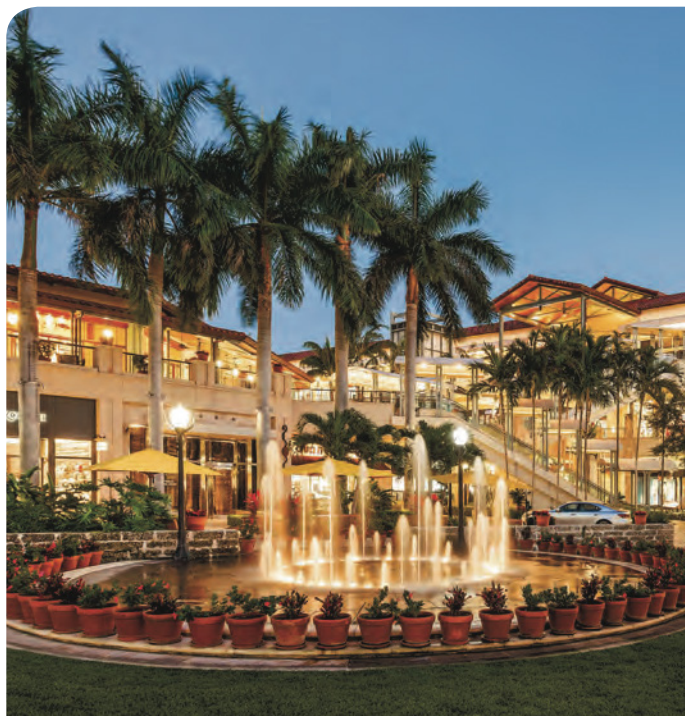
The Shops at Merrick Park